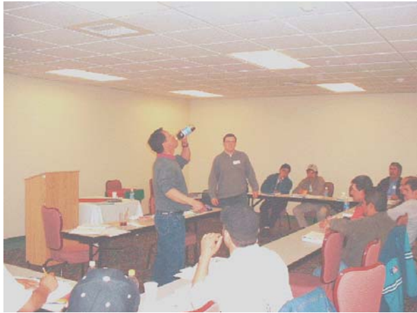
Trainers at work! A pair of participants presents information on the dangers of taking pesticides home using what they learned about training methodology; in this case trainers perform a role play during the practice training session.