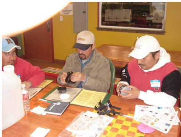
Participants learning how to assemble and inspect a respirator during one of the hands-on exercises of the Respiratory Protection Module.

The Hands-on training program delivers effective and relevant pesticide safety information in a "learning by doing" style. The techniques used are effective in overcoming learning barriers such as low literacy levels.